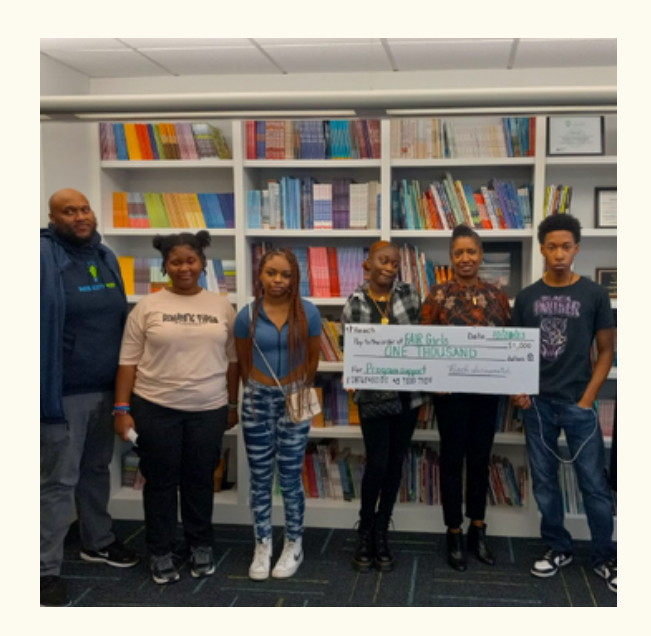
United for Change: FAIR Girls and REACH, Inc. celebrate a meaningful partnership, working together to empower teens and combat human trafficking in our community.

The generous donation from REACH will play a pivotal role in offsetting the costs associated with future outreach and education materials. These resources are instrumental in designing events aimed at informing more teens about the warning signs of human trafficking and empowering them to avoid victimization.